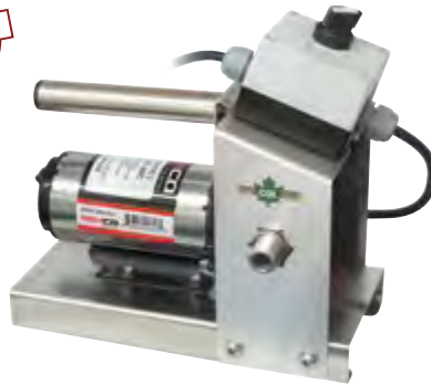
Electric diaphragm pump with support