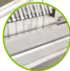
Option : WFCDL15DEF

MADE ENTIRELY IN CANADA AND THE UNITED STATES