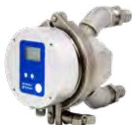
Continuous Brix reader