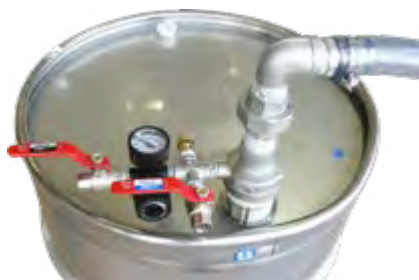
Pneumatic stainless steel barrel pump