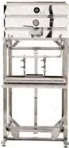
Electric water jacketed tank 35 gallons 67422