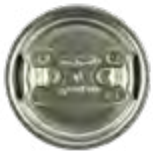
2" stainless steel cap BUNGSS