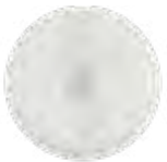
2" plastic cap for barrels (Large thread / hole 3/4" NPT in center) BUNG06