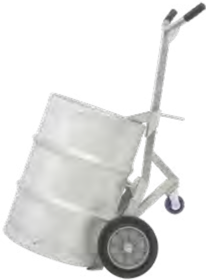
3-wheel stainless steel cart 676055S