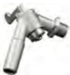
Bottling valve 3/8", 90° ECDVP804