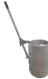
Stainless steel lever 671092