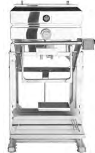
Electric water jacketed tank 12 gallons 67422-M