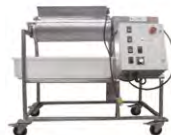
Single: Capacity of 17 lb.