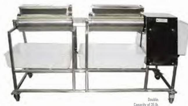
Double: Capacity of 35 lb.

8" automatic maple sugar machine 668855A