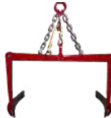
Barrel lifter with pulley and cord 665045