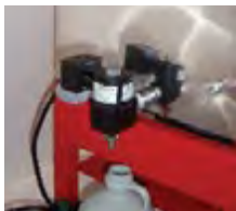
Electric bottling valve Includes 3 stainless steel tips: 1/4", 3/8", 1/2" 67217