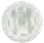
2" plastic cap (Can be used with bag 663332) 660057