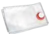
32-gallon plastic bag 663332