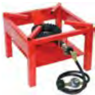
Propane burner R-65 66803