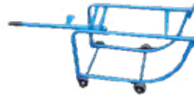
Barrel trolley DRUROC