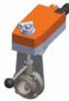
Motorized valve 120V ON/OFF 1 1/2" 668408S