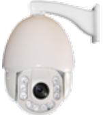
Digital HD camera IP20X 120M 20200